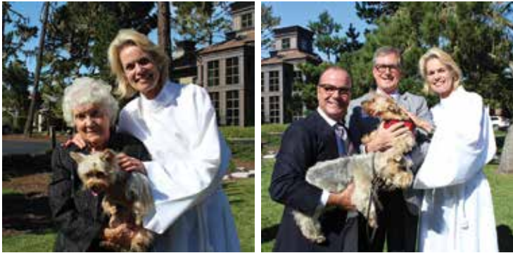
This past Sunday, Church in the Forest held the "Blessing of the Animals" on the lawn by the church as well as down at the Pebble Beach Equestrian Center