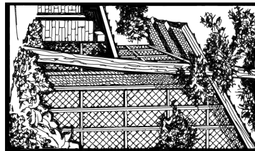
Painless and Economical